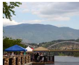
Trail's Downtown Markets, held on the Esplanade during the summer months

fully in the next article), the executive was pleased with our sales and efforts this year.